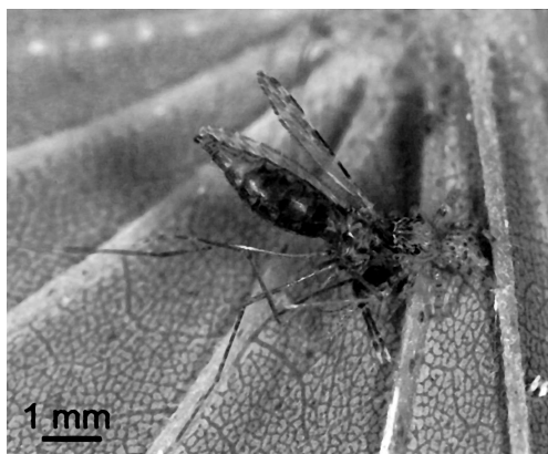
Figure 1.—Small juvenile of Evarcha culicivora feeding on female mosquito ( Anopheles gambiae ). After attacking by grabbing hold of mosquito's posterior ventral thorax from underneath, the salticid has now shifted to feeding from the side of mosquito's thorax.

General. —All testing was carried out between 0700 and 1900 h (laboratory photoperiod 12L:12D, lights on at 0700) at the Thomas Odhiambo Campus (Mbita Point) of the