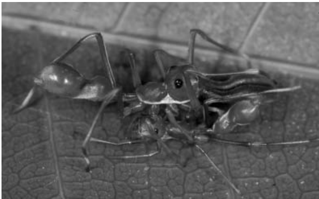
Figure 7. Male and female of Myrmarachne assimilis copulating. Male standing beside female (facing to right) while applying palp. Female: cephalothorax lowered; abdomen flexed and rotated.

Stand at side of female: after mounting, male stands with his body to left or right of female's body, legs I, II, and III over her body, but tarsi in contact with substrate on female's other side (usually not touching her) with his closer palp flush with anterior end of female's abdomen (Figure 7).