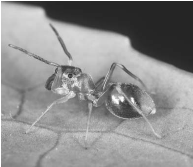
Figure 9. Myrmarachne bakeri female (facing to left) posturing (erect legs in Position 2).

became quiescent in front of a male and the male approached. When he was within touching distance, he brought erect legs I into Position 1 over the female's legs I or cephalothorax (Figures 3, 6), after which she sometimes decamped (sometimes after first lunging), and sometimes remained quiescent while copulation (Figure 7) ensued. The duration of courtship was usually about 2 min.