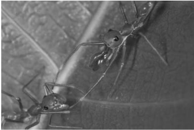
Figure 6. Myrmarachne assimilis male (upper right) beginning to premount tap female. Male's legs I semi-erect in Position 1. Female: palps spread apart.

Embrace: two spiders stand face to face with chelicerae touching, usually with palps erect and with legs I erect in Position 3 or 4 and sometimes with some combination of palps, legs I and legs II also touching.